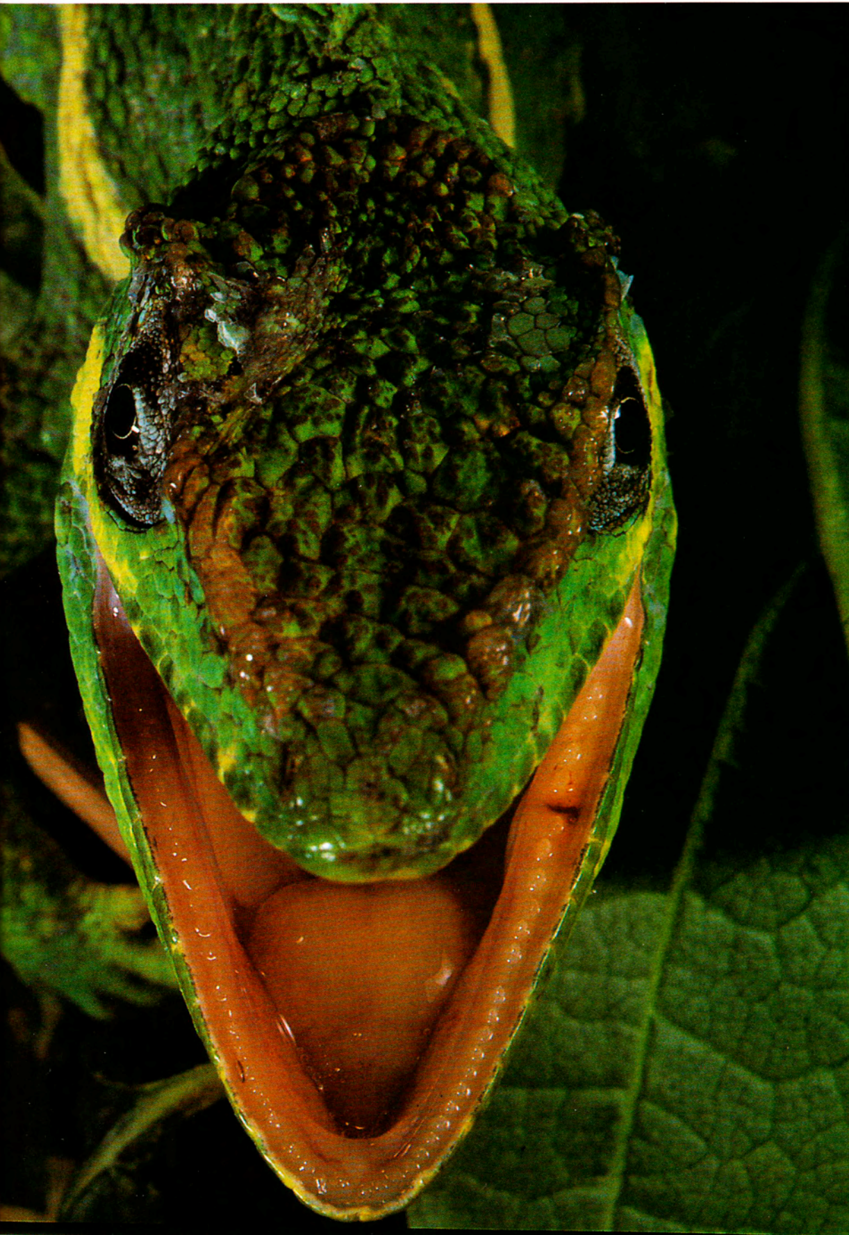
Jim Merit: Visuals Unlimited

The largest of all 400 members of the anole tribe, Anolis equestris , the Cuban knight anole, can reach a length of eighteen inches. When threatened, this giant puffs up to appear even larger, balls up its red tongue in the front of its mouth, and gapes menacingly.