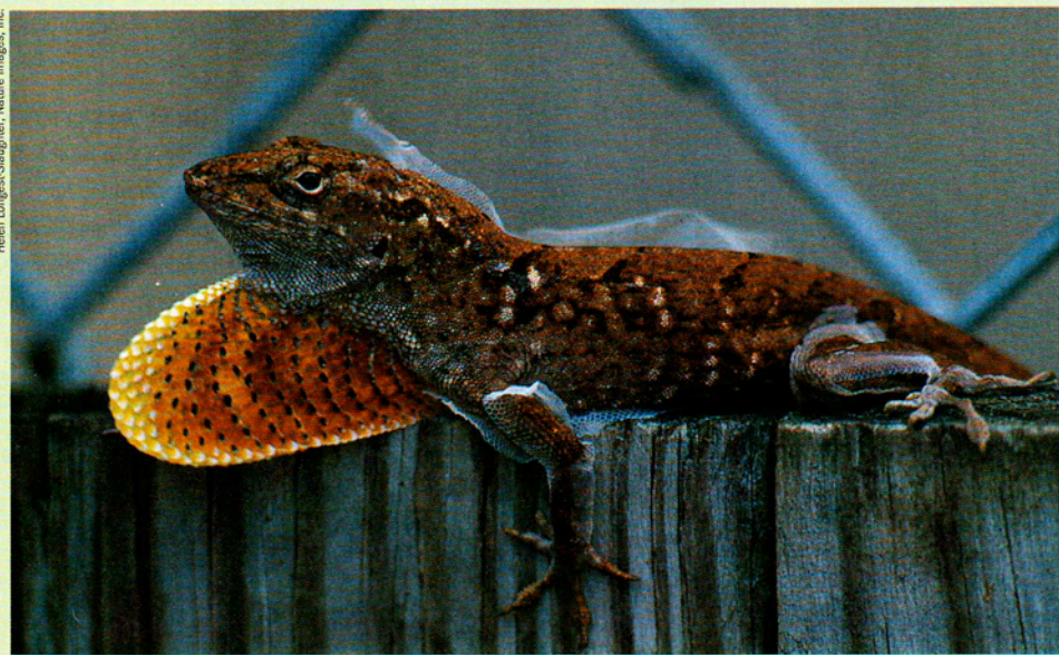
A male Anolis sagrei (in the process of shedding its skin) displays a distinctive dewlap.

The brightly colored and often strikingly distinct dewlaps also serve as species ID cards. For example, the dewlaps of the Cuban base-of-the-tree anoles are unmistakable: one is white, another is orange with yellow spots, a third is red with a white rim, and the fourth is yellow with big splashes of red. Laboratory experiments show that male anoles will ignore males of their own species that have had their dewlaps painted a different color (with removable lipstick) but will react aggressively toward males of other species whose dewlaps have been colored to resemble their own.